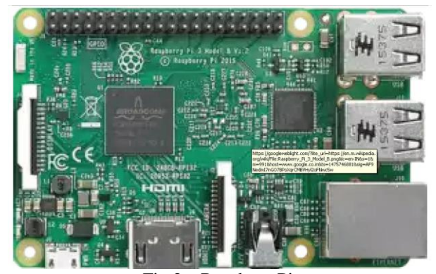
Fig 2. RaspberryPi