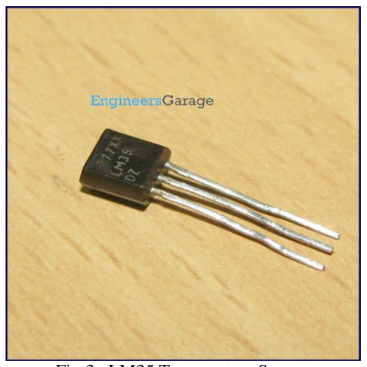
Fig 3. LM35 Temperature Sensor

Boiling steam is used in temperature sensor. Temperature converts to voltage level using 3 pins such as GND, Voltage source and Output voltage. If temperature increases then voltage will be increase. It senses any level of temperature. The LM35 Temperature sensors are integrated circuit device. The temperature sensor measured in Kelvin. The output voltage of an LM35 temperature sensor is linearly proportional to the centigrade temperature. The LM35 is beneficial than linear temperature sensor. The device used single power supply.[7]